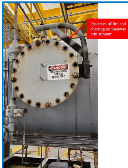
Incident 1: Flammable vapors escaped from the manway, which were ignited by the falling sparks.