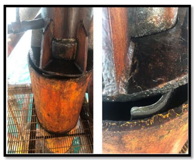
Figure 2 - Part of casing protruding out of well drive-pipe.

On May 15, 2021, an incident resulted in the fatality of an offshore worker when two production personnel were pressure testing a 16-inch well surface casing and an explosion occurred. The explosion entailed a high-pressure release with no signs of ignition.