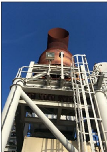
Figure 1: Looking up at the silencer.

After TGen3 was shut down, a walkdown revealed pieces of perforated steel from inside the silencer (Figure 1) scattered on the deck (Figure 2), some weighing as much as 44 pounds. The steel had failed around the supporting struts and was ejected from the silencer exhaust tip approximately 110 feet above the deck (Figure 3).