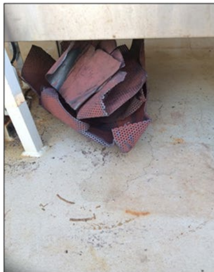
Figure 2: Perforated steel section.