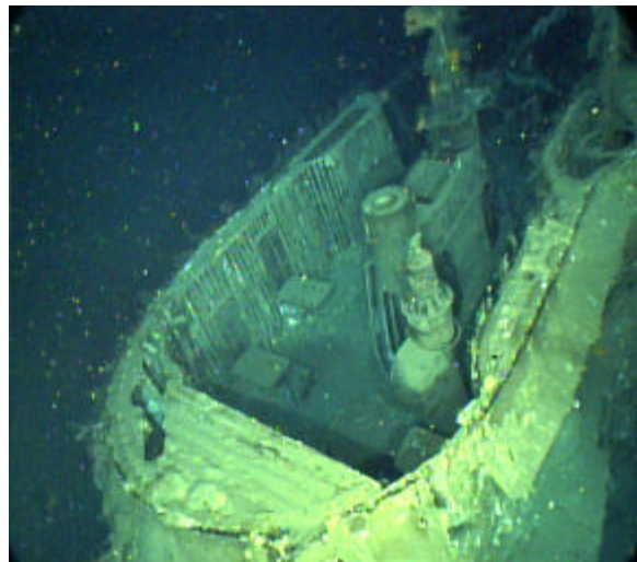
Figure 6. Video capture photo of the U-166 Conning Tower.

series of short and long-term experiments placed at the site and by collecting rusticle samples, which are formed as a result of the bacteria activity at the site (Figure 5). The long-term test platforms placed near the wreck will aid in determining the rate of biocorrosion at the site. The microbiology data collected will also provide a comparative analysis for work Droycon is currently conducting on the RMS Titanic, DKM Bismarck, and the HMHS Britannic. Early biological analysis revealed a variety of rusticles present at the site including a rare white rusticle that was only previously found on the Bismarck.