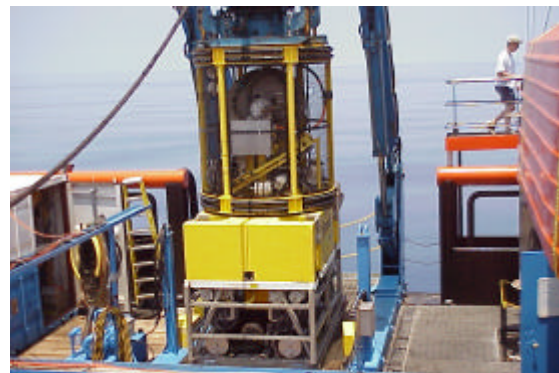
Figure 4. Sonsub's Innovator ROV