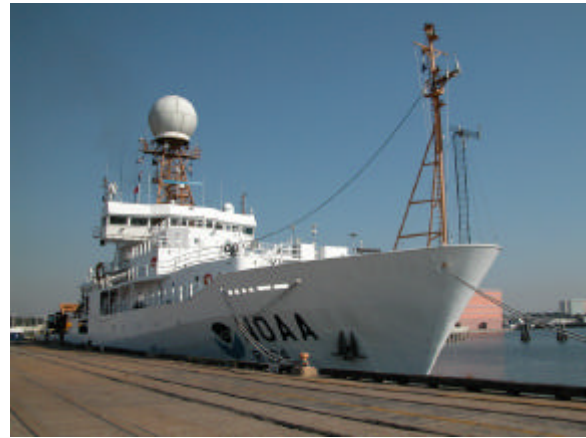
Figure 3. NOAA Ship Ronald H. Brown

It was decided that the NOAA Ship Ronald H. Brown would be used for this project (Figure 3). The class-one research vessel was already being utilized consecutively on three additional OE-sponsored expeditions in the Gulf of Mexico, and the U-166 Project rounded out the fieldwork. The U-166 project was the only maritime archaeology cruise, while the other expeditions focused on marine biological communities. By coordinating these cruises in tandem on one vessel (and in some cases combining projects on the same research leg), OE was able to maximize ship time while minimizing mobilization and demobilization expenses.