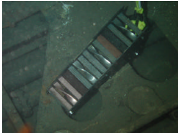
Figure 5. BART Test Platform set at the U-166 site.