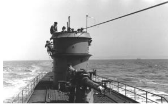
Figure 1. Photo of the U-166 .

Twenty-four German U-boats operated in the Gulf of Mexico during World War II. In approximately one year's time, they sank 56 merchant vessels with only one U-boat lost, U-166 (Figure 1). The U-166 , under the command of Oberleutnant Hans-Günther Kuhlmann, entered the Gulf in July of 1942 and began her secret mission of laying mines near the mouth of the Mississippi River. Having completed that task by July 25, Kuhlmann positioned U-166 along the shipping lanes to conduct warfare on merchant shipping. 1 On July 30 th the passenger freighter Robert E. Lee and her naval escort PC-566 were transiting across the Gulf en route to New Orleans, LA. At approximately 4:30 in the afternoon the Robert E. Lee came into the sights of U-166 . Almost without warning a torpedo struck the starboard side of the freighter. As she began to sink PC-566 rushed in and began depth charging the U-boat. 2 The naval Patrol Craft was successful in sinking the U-166 that July afternoon. The credit for sinking U-166 , however, was given to a U.S. Coast Guard seaplane, which actually boomed a different U-boat, U-171 , two days later and 140 miles farther to the west. The true account of what happened to U-166 would not be discovered for nearly fifty-nine years. 3