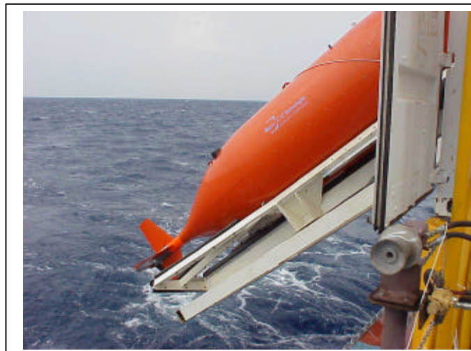
Figure 2. HUGIN 3000 AUV The HUGIN 3000 AUV is capable of surveying to 3000 meters water depth. It operates at approximately 4 knots with greater mobility and accuracy than conventional towed arrays. Operating in 1400 meters of water the HUGIN 3000 's positional accuracy is approximately 3 meters after post processing. The AUV utilizes a state-of-the-art multibeam bathymetry system, a dual frequency chirp side scan sonar, chirp sub-bottom profiler, a inertial navigation system coupled with the HiPAP (High Precision A coustic P ositioning) acoustic tracking system.

After C & C's archaeologists reviewed the AUV survey data, they suspected the target originally thought to be the freighter Alcoa Puritan , might actually be the long sought after German U-boat, U-166 . Additional historical research and AUV surveys helped add strength to the archaeologist's theory. Shell and BP sponsored an ROV investigation of the site to confirm the findings.