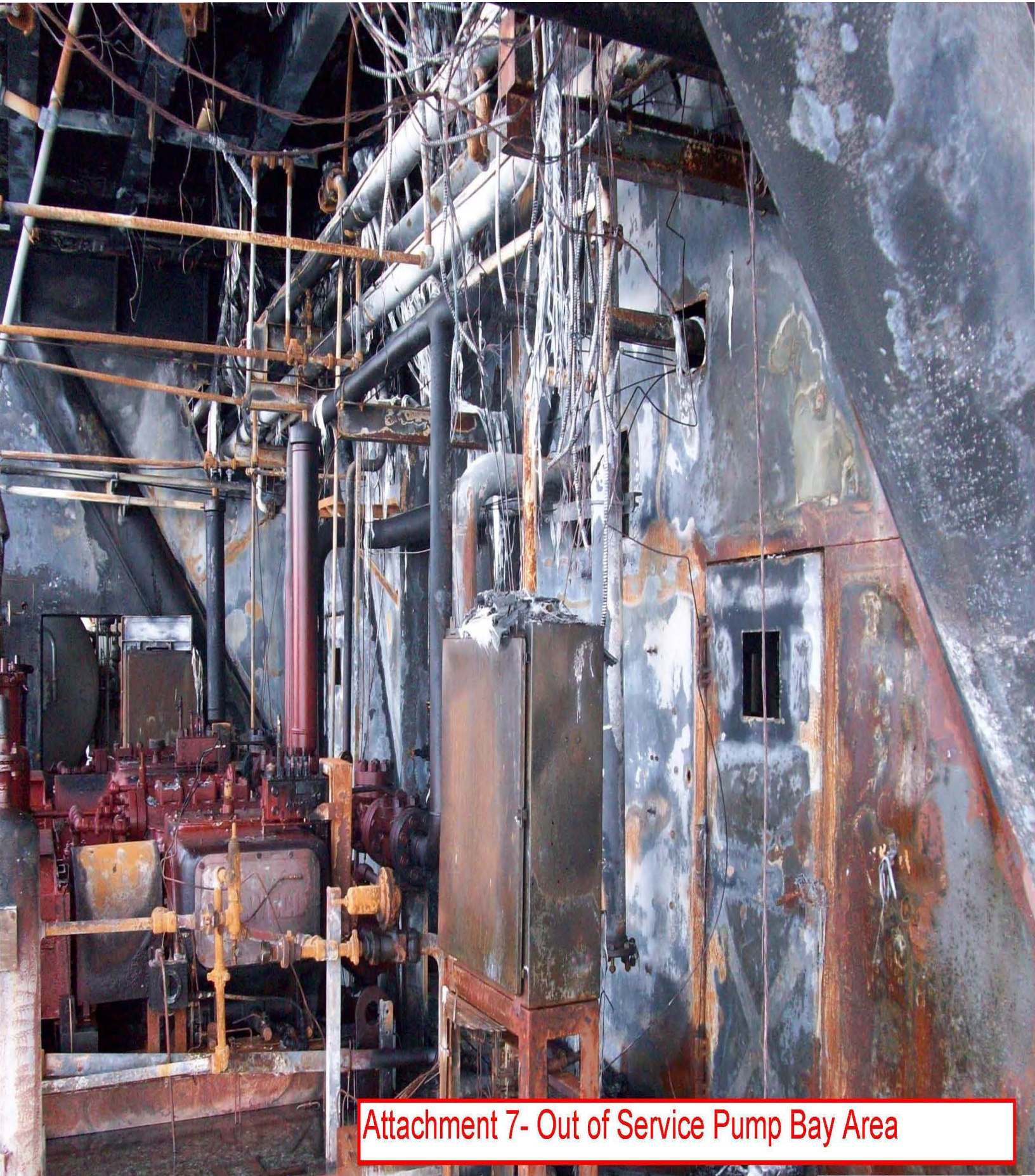
Attachment 7- Out of Service Pump Bay Area