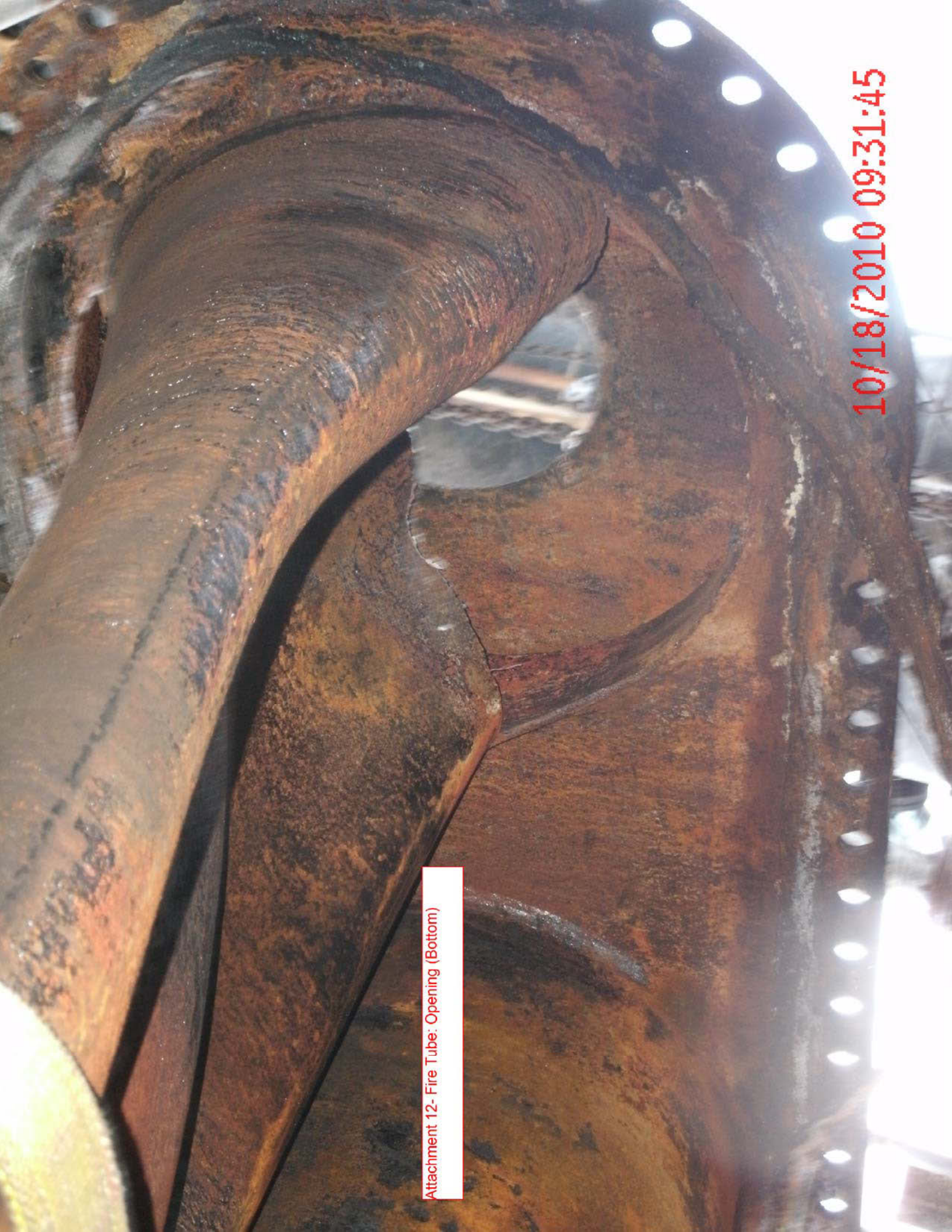
Attachment 12- Fire Tube: Opening (Bottom)