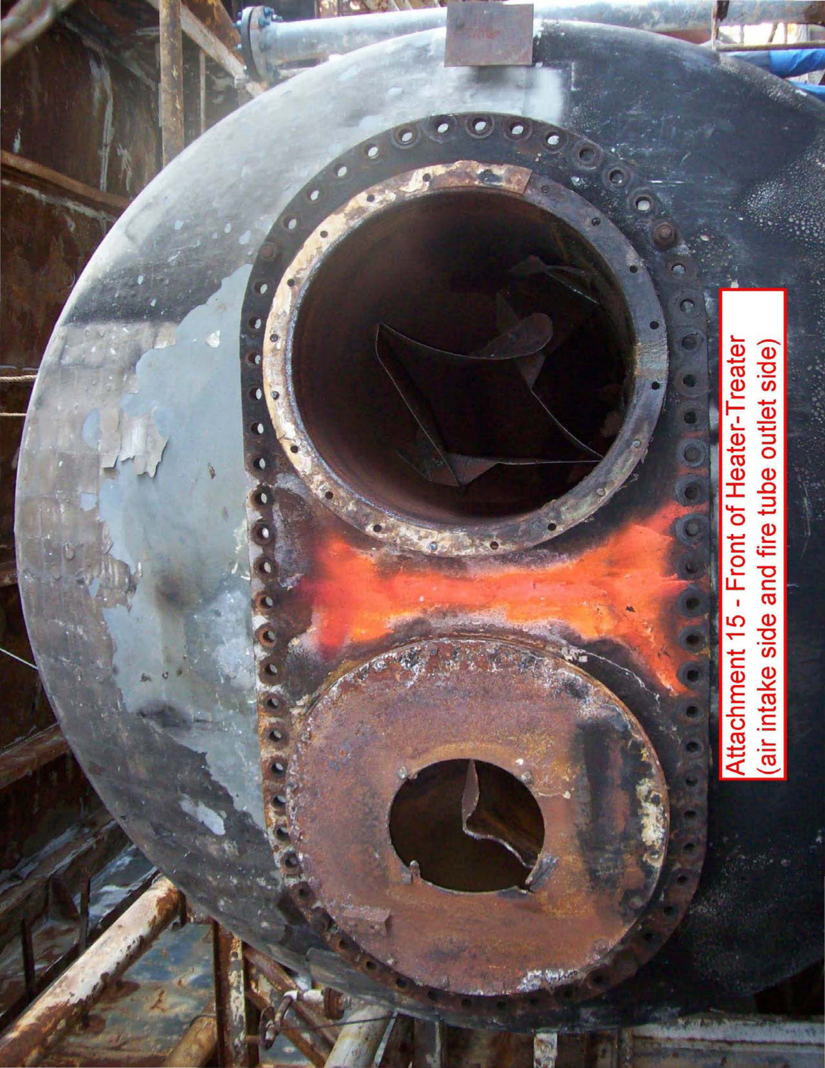
Attachment 15 - Front of Heater-Treater (air intake side and fire tube outlet side)