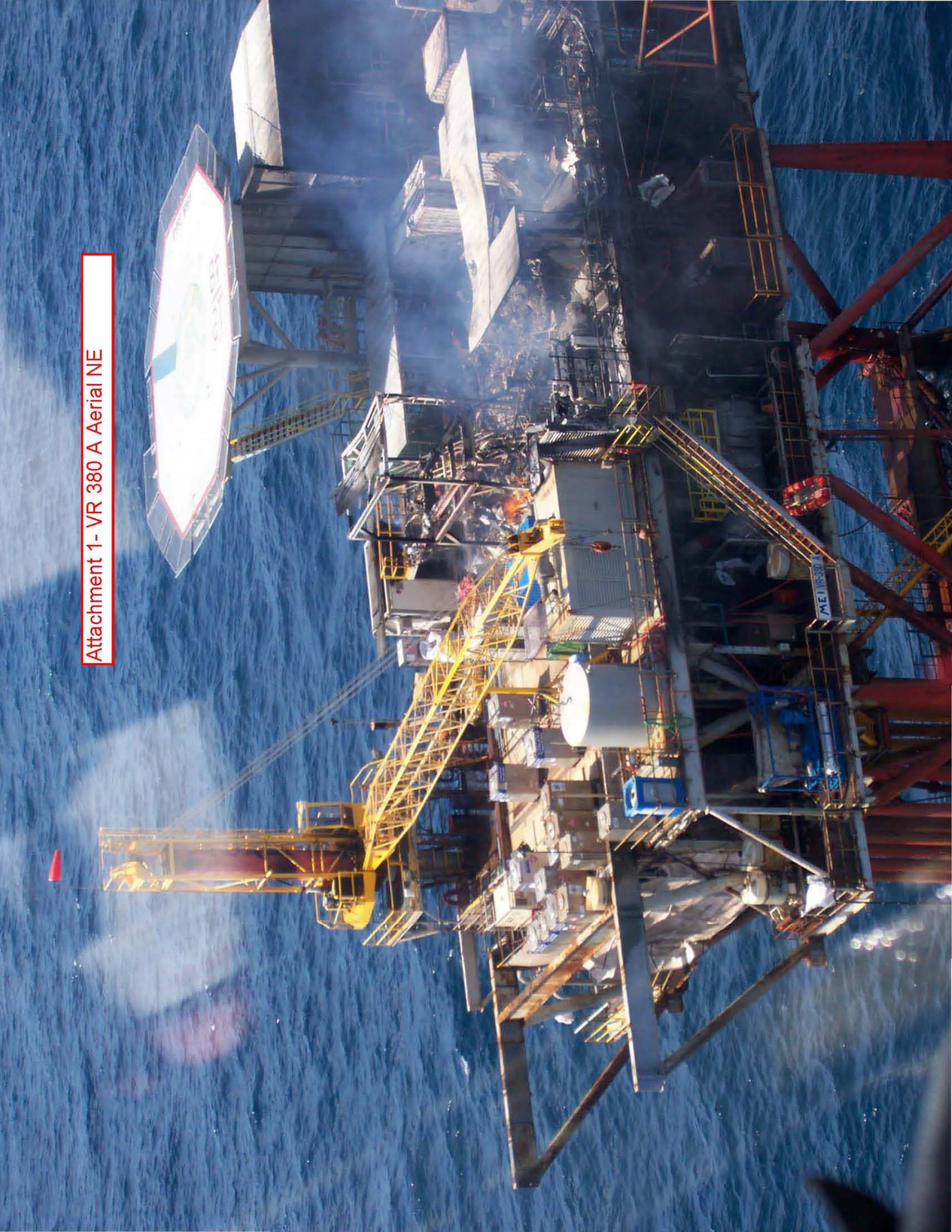
Attachment 1- VR 380 A Aerial NE