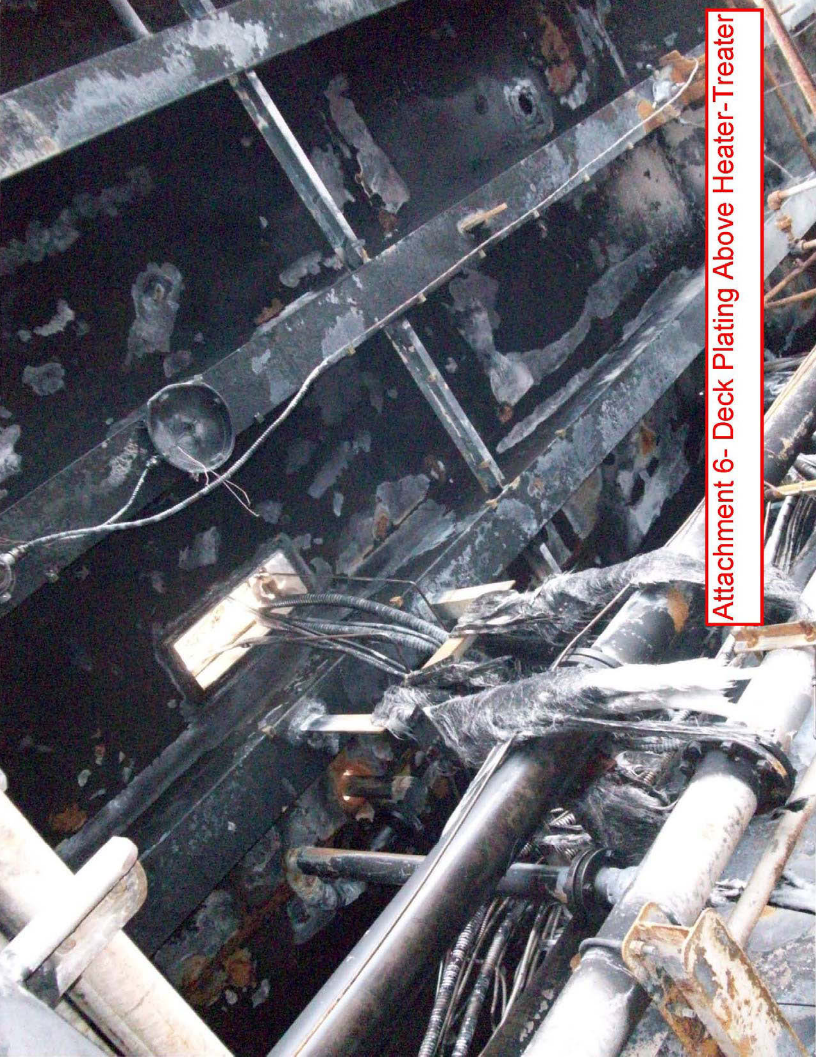
Attachment 6- Deck Plating Above Heater-Treater