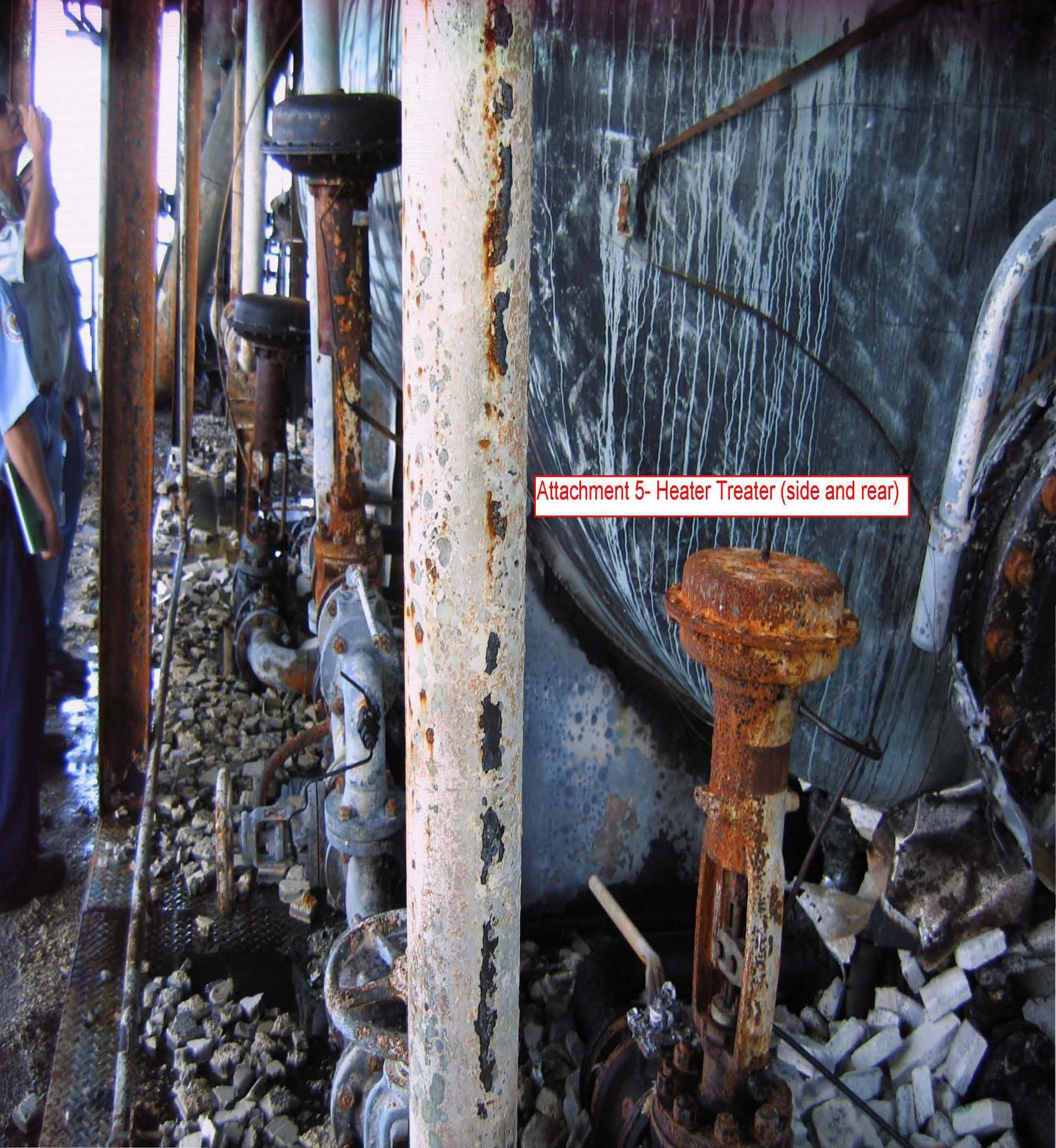
Attachment 5- Heater Treater (side and rear)