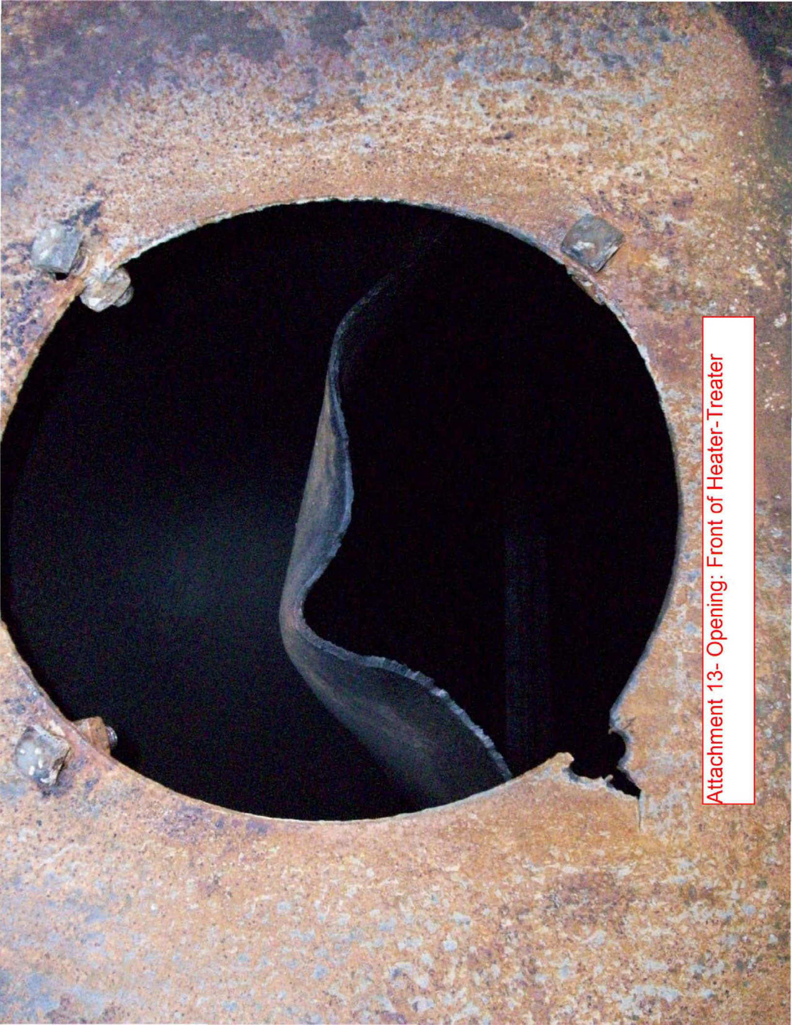
Attachment 13- Opening: Front of Heater-Treater