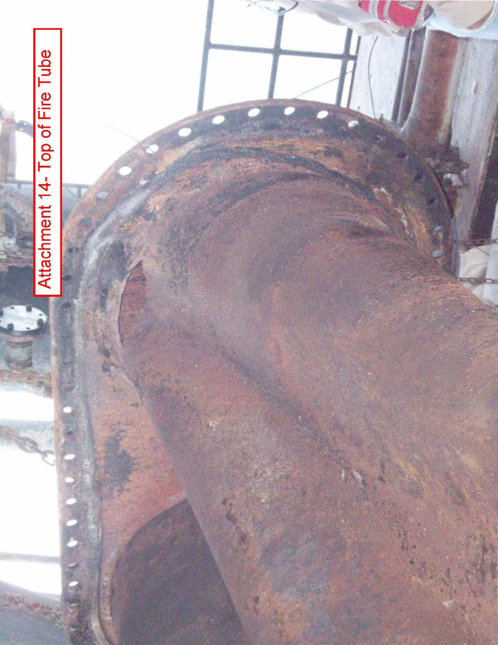
Attachment 14- Top of Fire Tube