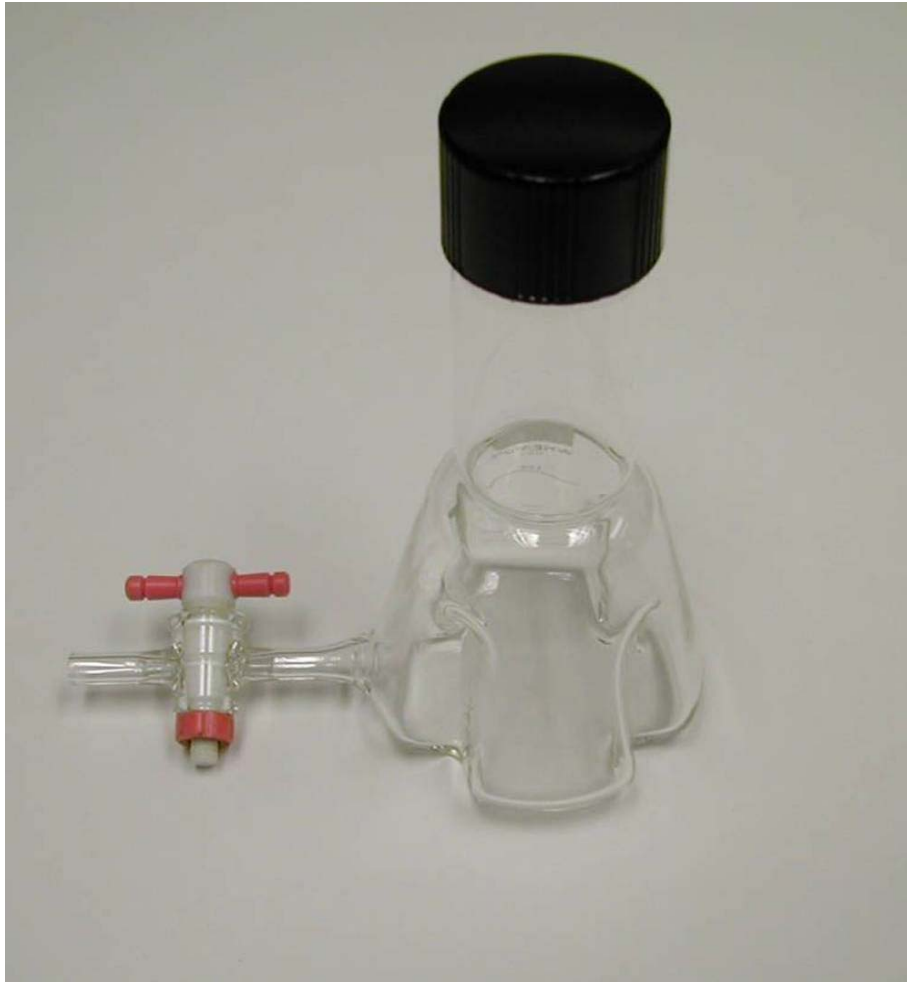
Figure 1. Baffled Flask Test Apparatus

An orbital shaker (Lab-Line Instruments Inc, Melrose Park, IL) with a variable speed control unit (40-400 rpm) and an orbital diameter of 0.75 inches (2 cm) was used in order to provide turbulence to solutions in test flasks. The shaker has a control speed dial