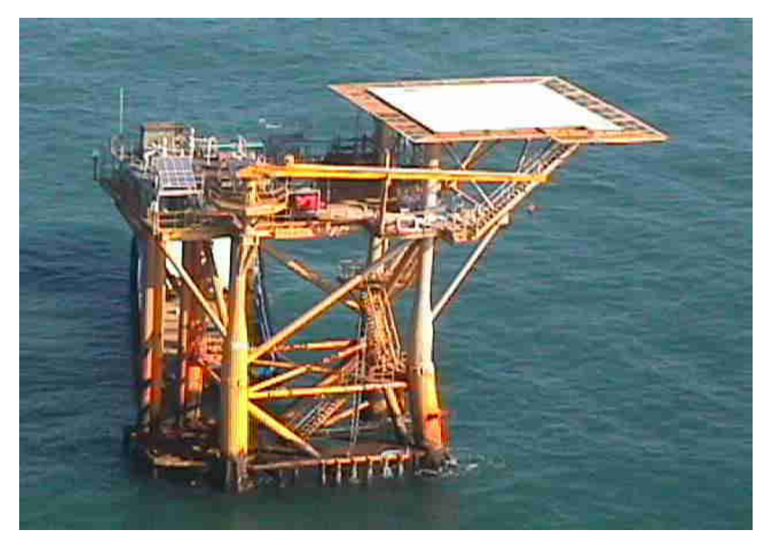
Figure 1: Photo of PN 969, Platform JA.

designated Operator on October 3, 2007. The platform is an unmanned facility that is operated on behalf of Peregrine by WGPS' personnel quartered at Platform A, PN 975.