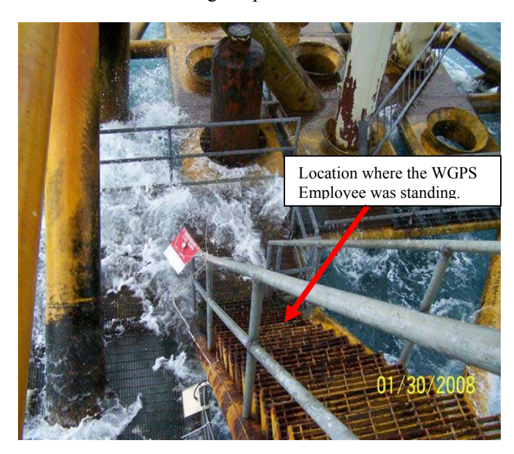
Figure 3: Photo of the WGPS Employee's location on stairs leading to boat landing.

was assumed that the ESD was the likely cause of the shut in. If the ESD was determined to be the cause of shut in, the plan was to affect permanent repair if feasible (temporary if needed) in order to bring the platform back online. The WGPS Employee (presumably) determined that the permanent fix was feasible and descended the stairways to an elevation of approximately +10 to +12 feet above the boat landing.