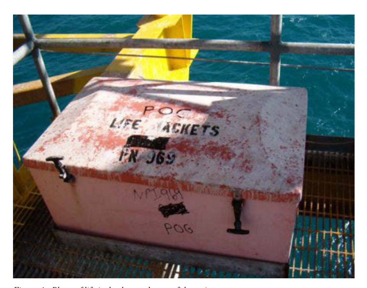
Figure 4: Photo of life jacket box at the top of the stairs.

There was a WGPS policy granting all individuals "stop work authority" for reasons of safety at the time of the incident. Interviews indicate that the WGPS Employee, the OSW, and the Lead Operator were aware of the policy. No employee exercised this authority to stop work.