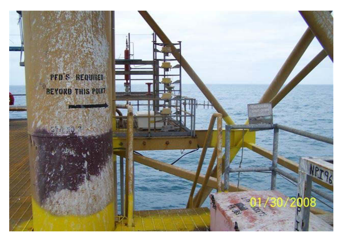
Figure 5: Photo of sign stating "PFD'S REQUIRED BEYOND THIS POINT".