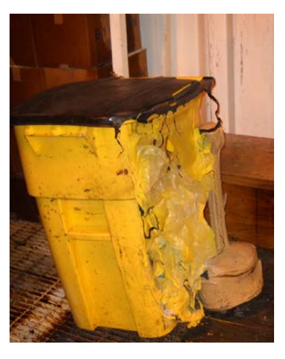
Damaged Trash Can and Cigarette Butt Container

Recently, personnel on an offshore platform, smelled smoke and exited their quarters to find a small unplugged freezer in the smoking area engulfed in flames. Personnel extinguished the fire using fire extinguishers and doused all smoldering areas until the situation was brought under full control. It was determined that a plastic cigarette butt container had ignited, and the resulting flame spread to the freezer, another cigarette butt container, a plastic trash can, and the plywood support upon which all were located. The original butt container from which the fire emanated was completely consumed by the fire.