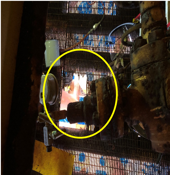
Figure 1. Grating Failure on a casing deck that resulted in a fatality.