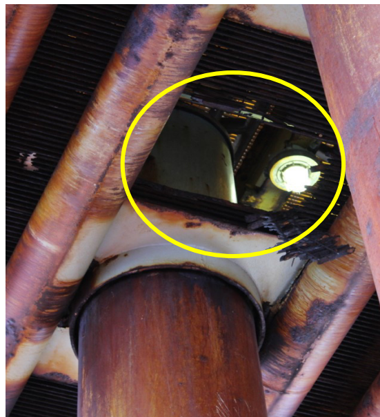
Figure 2. View from below the Grating Failure that resulted in a fatality.

During a planned maintenance and construction outage on a production platform on May 16, 2020, a contractor working on the casing deck inside of a hard-barricaded area (Figure 1) fell 30-40 feet to the deck below (Figure 2), resulting in death.