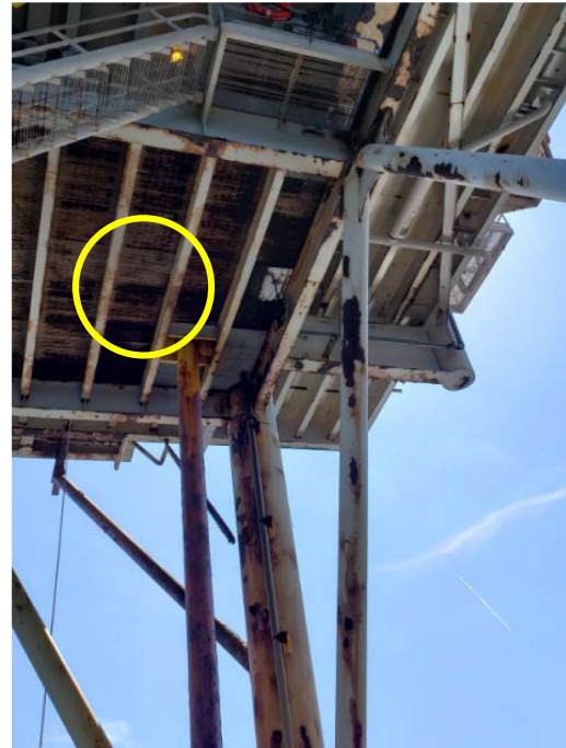
Figure 4. View of grating from plus-10 on a facility that resulted in a serious near miss.

Therefore, BSEE recommends that operators and contractors consider the following: