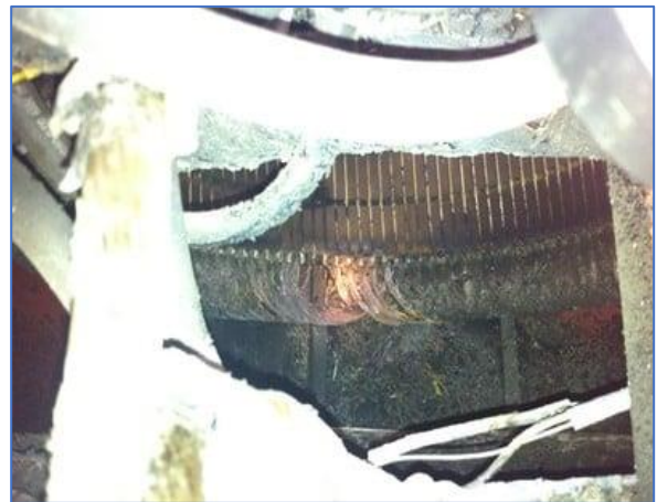
Fig. 2. Burnt Stator Winding of Generator

During start-up and commissioning, several rental generator incidents occurred on the U.S. Outer Continental Shelf (OCS) in 2021. These incidents involved rental generator failures resulting in fires, arc flashes, and work stoppages. Lack of certifying rental equipment integrity (e.g., inadequately/improperly maintained generator) has been shown to be one of the key indicators leading to these incidents.