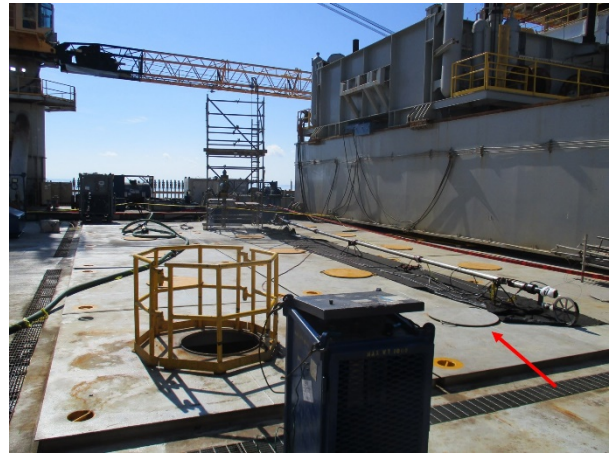
Incident site at GC 205 A – photo taken June 2 nd

Recently at Eugene Island Block 331, Platform “B,” a night-time production operator on a fixed facility was identified as missing from the platform during morning rounds. The personnel onboard noticed a section of grating displaced in the upright position with the missing person’s hardhat and clipboard next to the grating in the wellbay deck. The open hole measured approximately 93-inches long by 13-1/2 inches wide and was approximately 45 feet to the water’s surface. Preliminary information indicates that prior to the incident the wellbay deck area was taped off with red “DANGER” tape, but the area was not hard barricaded to prevent flow of personnel.