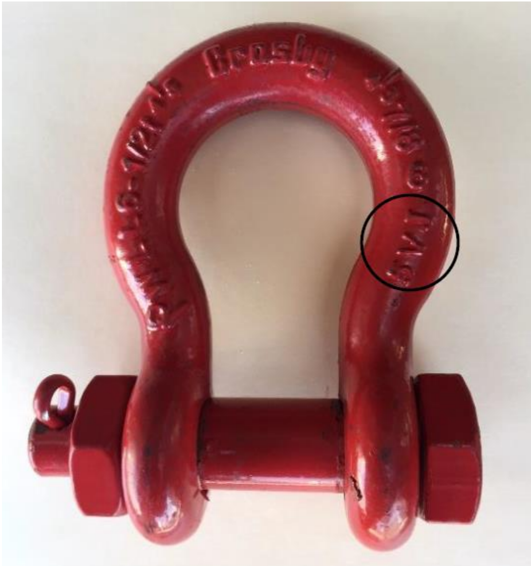
Production Information Code (PIC) 5VJ located on the 7/8" 6.5t shackle bow.